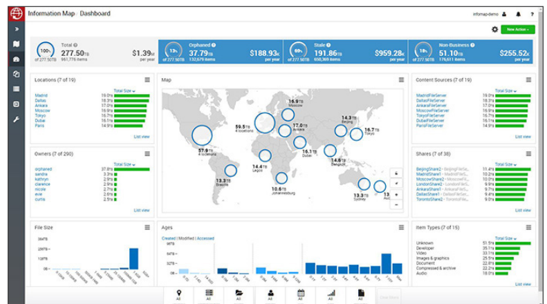
Figure 4. Veritas Information Studio renders your information environment in visual context and guides users towards unbiased, information-governance decision making.