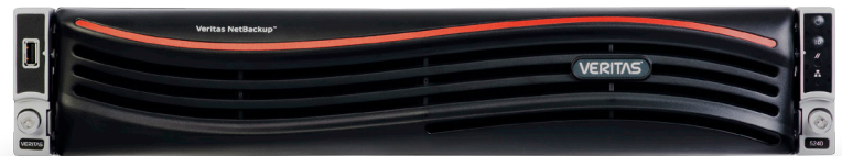
Figure 2. Veritas NetBackup™ 5240 is an integrated enterprise backup appliance with expandable storage and intelligent deduplication.